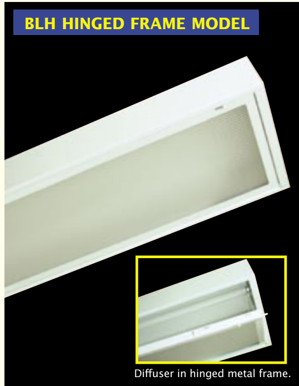
BLH HINGED FRAME MODEL