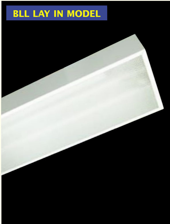
BLL LAY IN MODEL