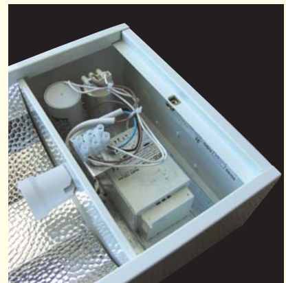
Tray mounted control gear