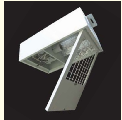
Hinged cover for ease of servicing