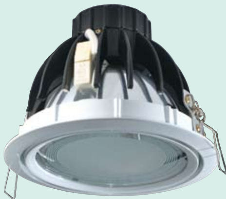
Lamp holder RX7s