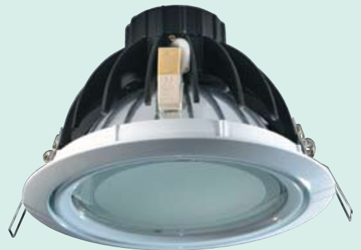
Lamp holder RX7s