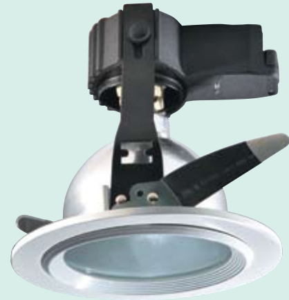
Lamp holder G12