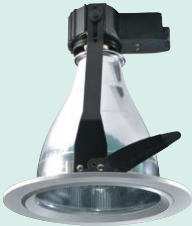
Lamp holder G12